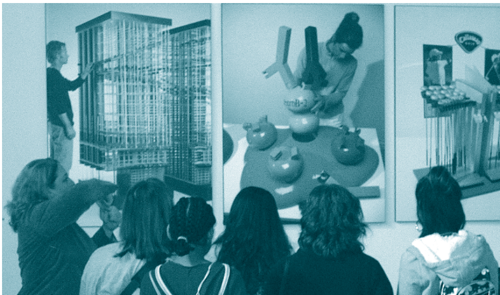
Portola Middle School girls took a trip to Gemmiti Model Art in San Francisco and learned about creating working scale models of everything from the White House to antibodies. (See full story on page 1)

Printed on recycled paper using soy inks.