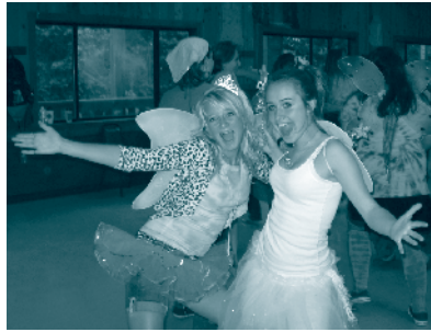
CITs dress up and act silly at Kamp Konocti.