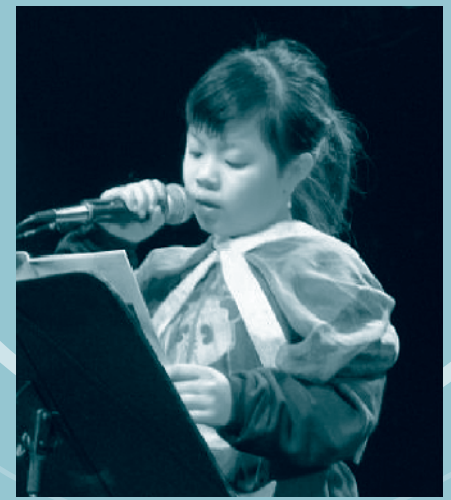
Elks Lodge Write On! program helps Girl Scouts speak up and speak out.